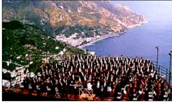
Extraordinary performance. ▲ World-famous orchestras on a stage hung out over the "big drop."

the ragazzi/e like so much. ( It all stops Cinderella-like at midnight, by the way, when the Law says "the villagers shall sleep." They do & they don't. )